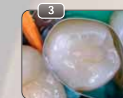
Opaque dentine base layer applied in increments