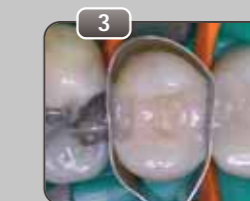
Incremental layers of opaque dentine base shade