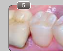
Finished, polished restoration (vestibular view)