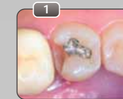
Fractured occlusal-distal amalgam filling in tooth 45