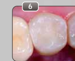
Finished restoration from occlusal 29