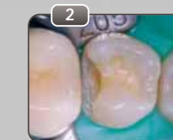
Placement of rubber dam and removal of remaining amalgam. Situation after complete excavation