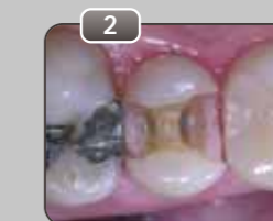
Situation after removal of the filling and complete excavation