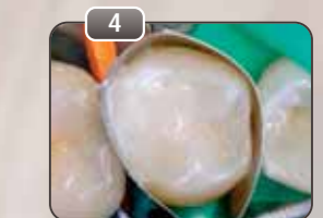
Final layer with translucent enamel shade