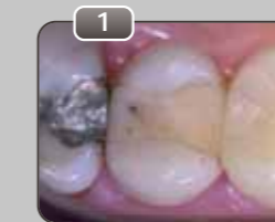
Insufficient mod composite restoration in tooth 35