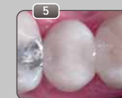
Finished, polished restoration